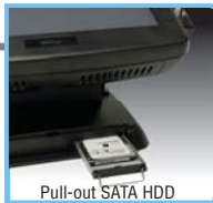
Pull-out SATA HDD