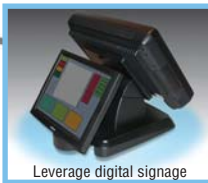
Leverage digital signage