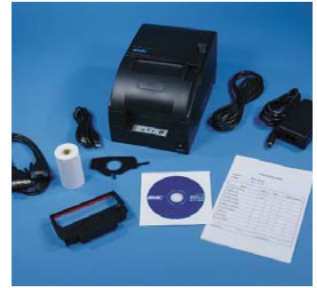
Includes Everything Necessary in the Carton