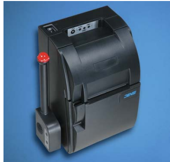
Built-In Wall Mount Capability and Optional Audio/Visual Print Messenger