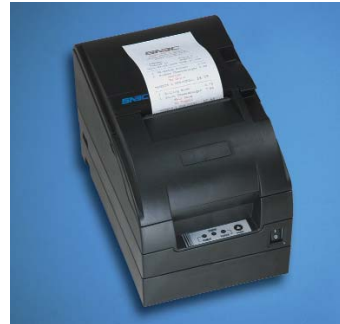
Conceal the Power Supply in the Optional Power Supply Cover